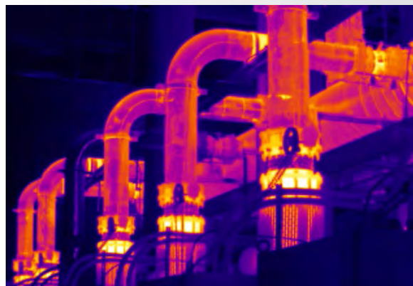
MultiSharp Focus, available on the RSE300 and RSE600 Infrared Cameras